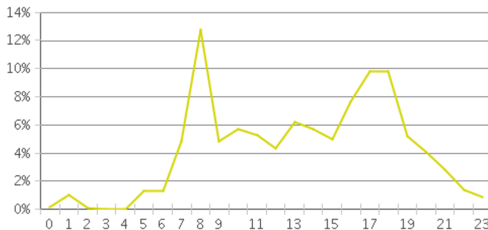
Hourly Profile during Weekdays