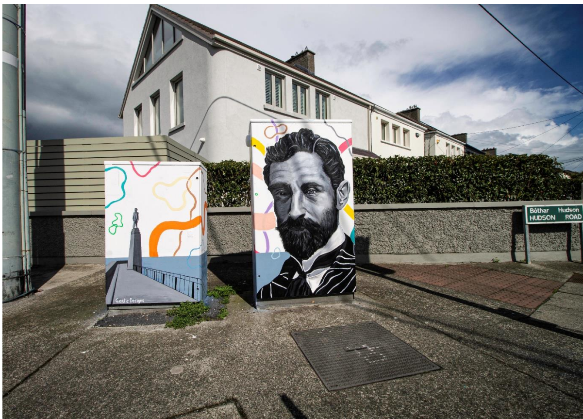
'Garlic Designs' by Roger Casement. Hudson Road/Adelaide Road, Glasthule, Dublin.