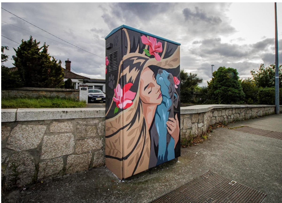
'Blossoming Relationships' by Darya Shkundeleba. Glenageary Road Upper, Dublin.