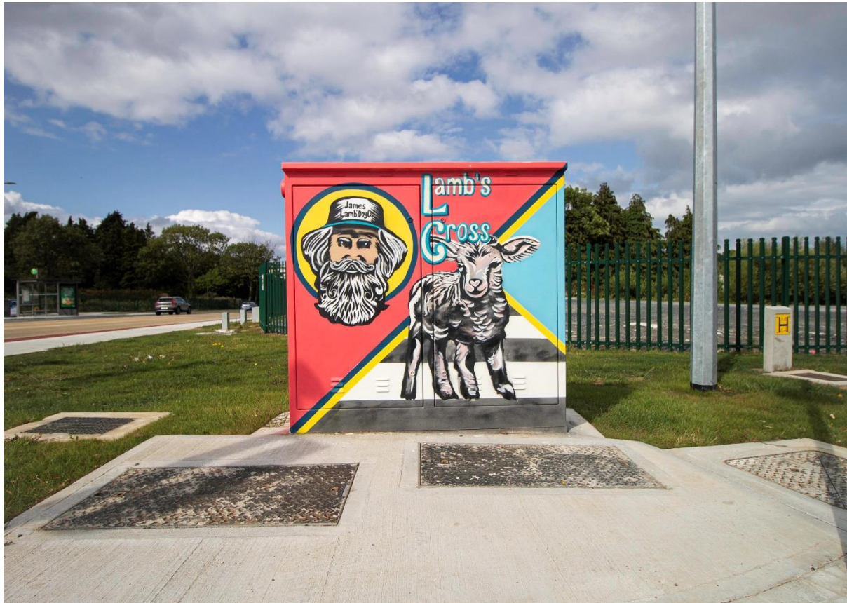
'Lamb Cross' by Tracey Moca. Enniskerry Road, Murphystown, Dublin.