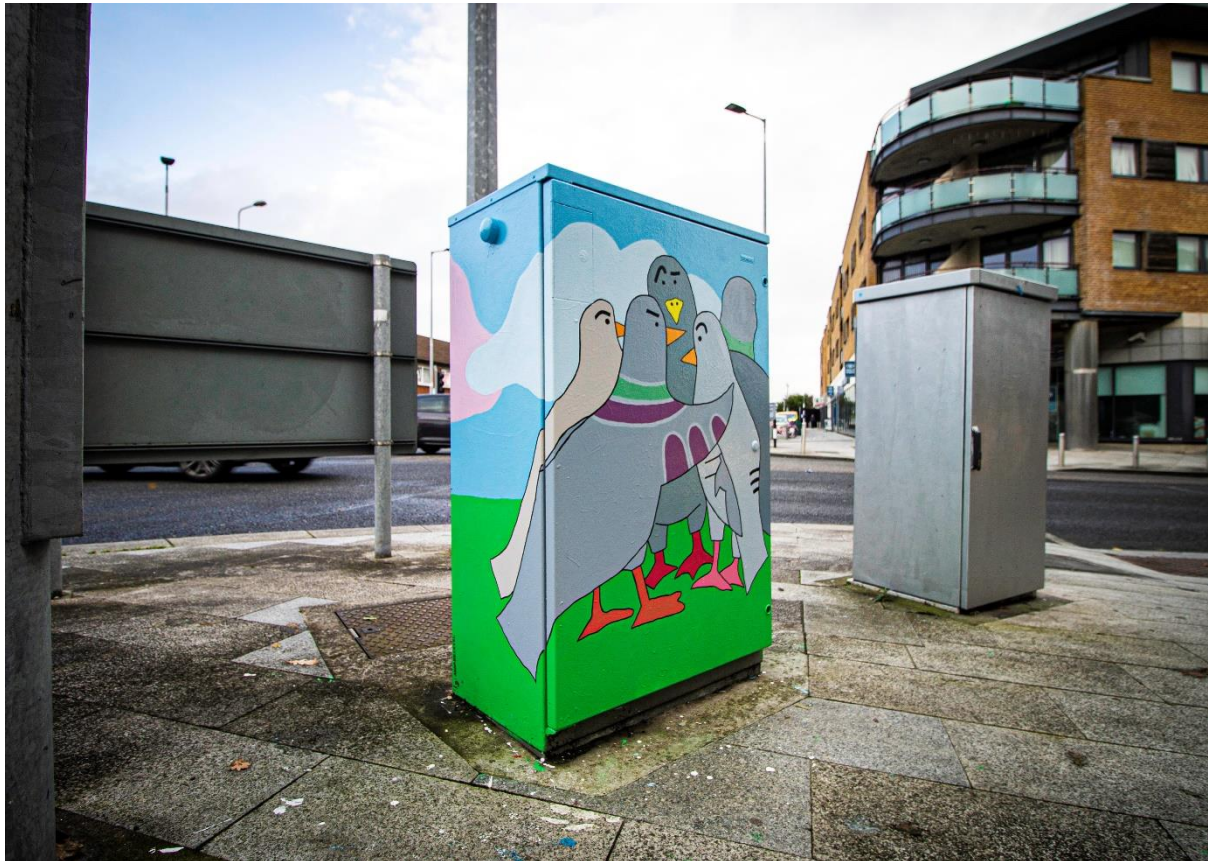
'Intruding' by Anna Becevel. Tallaght Village, Dublin 24.

Dublin Canvas is an idea, a public art project intended to bring flashes of colour and creativity to everyday objects within County Dublin. Less grey, more play! The project takes previously unused public space and transforms it into canvases to help brighten up each area. Making Dublin a more beautiful place to live, work and visit.